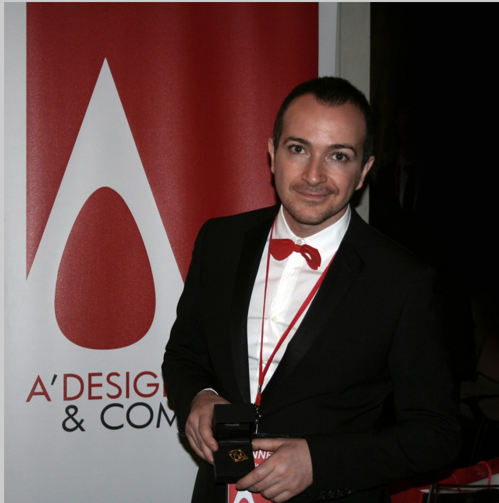
MATER by Emanuele Pangrazi